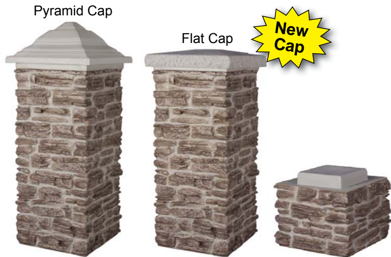
Main Pillar Section 21" x 21" x 46" high (Add 10 1/2" for pyramid cap and 4" for flat cap)