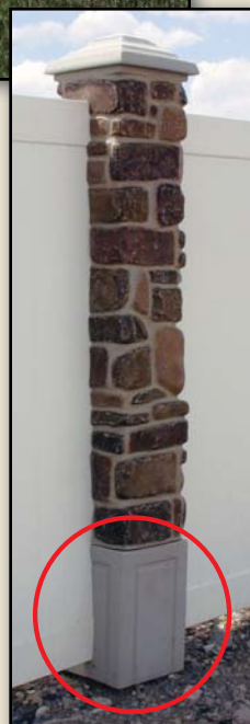
Pillar Riser 12" x 12" x 17 3/8" high (Same color as cap)