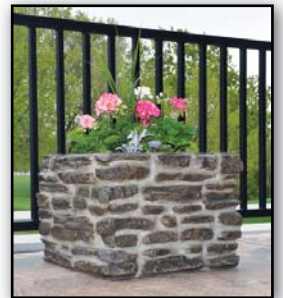
Flower Box Planter (Stack Section)